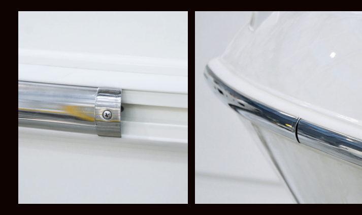
According to an ancient sailing tradition, screws should be tightened so that the head forms a cross and not an X.