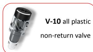
V-10 all plastic non-return valve