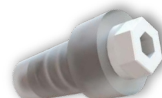
V-40 all plastic valve