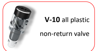
V-10 all plastic non-return valve