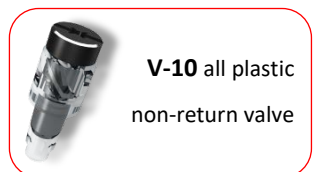
V-10 all plastic non-return valve